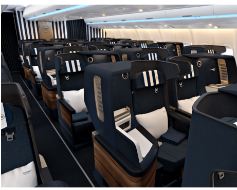
A330neo Business Class