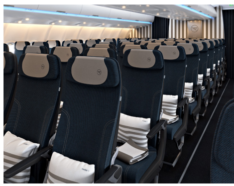
A330neo Economy Class