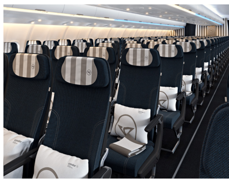
A330neo Premium Economy Class