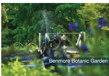
Benmore Botanic Garden