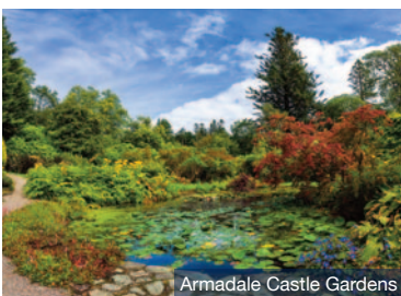
Armadale Castle Gardens