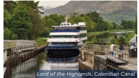
Lord of the Highlands, Caledonian Canal