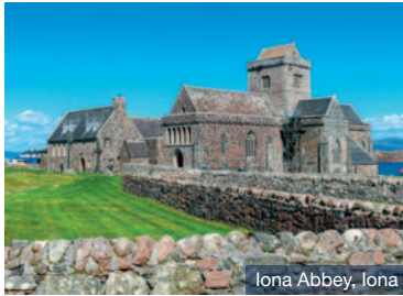
Iona Abbey, Iona