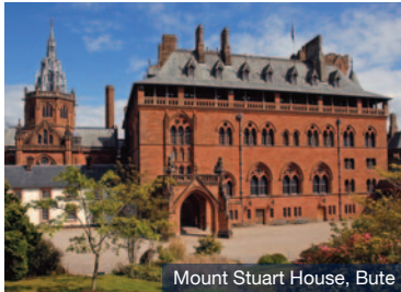
Mount Stuart House, Bute